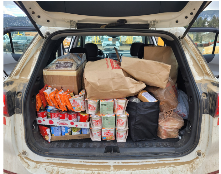
Team members from the Gross Reservoir Expansion Project donated $4,100 and about 200 meals of nonperishables to the Pastor's Pantry at Whispering Pines church at the end of 2022.