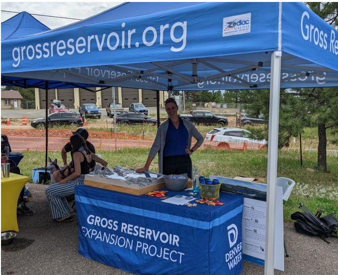
Denver Water continues to participate in community events such as Mountain Fest to keep the local community informed about the project.